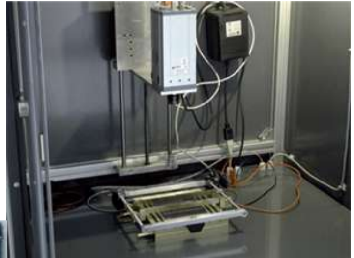
Figure 1 - The experimental setup for electroluminescence measurements. The cell is placed underneath the camera and electrically contacted from both sides.

Electroluminescence imaging can be used to detect a multitude of defects in crystalline silicon solar cells, for example cracks, grain boundaries, broken contacts and shunts [2]. It can also yield absolute mappings of serial resistance [3] and diffusion length [1]. In figures 2 and 3 a photograph and the electroluminescence image of one multicrystalline 3 x 3 cm 2 cell out of a laminated lab prototype module are shown. The electroluminescence image clearly shows a crack in the left half of the cell, which is not visible in the photograph. This crack was introduced while laminating the module and reduces the current of the whole module by ~25%. The effects of series resistance can also be seen in figure 3, as the radiation intensity decreases along the contact fingers towards the borders of the cell and in the area between these fingers. Figures 4 and 5 show the same cell, with exposure times of 1 s and 10 s (Note the different count scales). The difference in quality is very small, showing that the camera can deliver high quality images even at the short exposure times required for inline measurements in solar cell mass production.